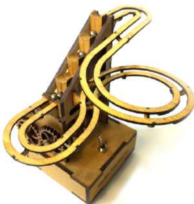
Marble Machine 1 Motorised