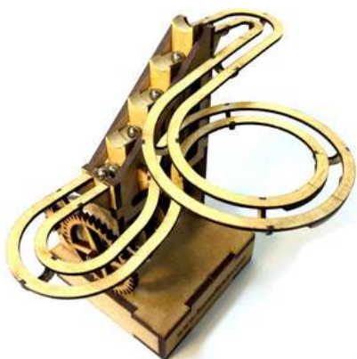
Marble Machine 1 Hand Cranked

We will email you the instructions for the kits you purchase. These instructions are easy to follow for 11yrs +. Construction takes around 2hours, there is no minimum or maximum number of kits you can order but pre-booking is required. We recommend a museum visit to support this activity but it's not essential.