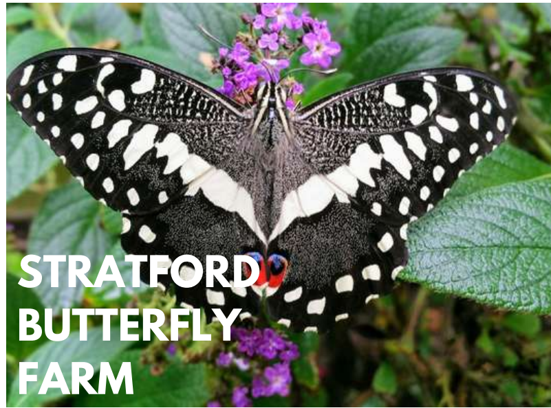
STRATFORD BUTTERFLY FARM