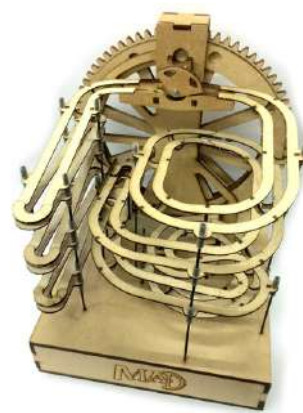
Marble Machine 2