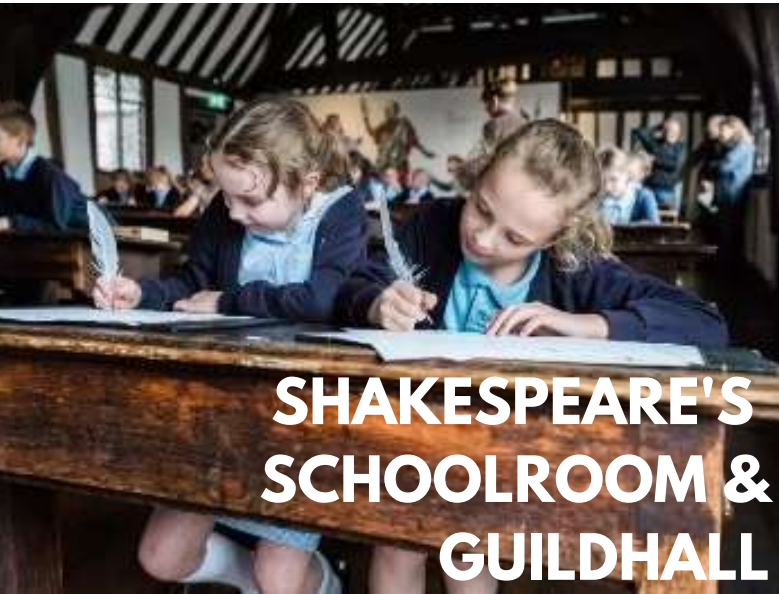
SHAKESPEARE'S SCHOOLROOM & GUILDHALL