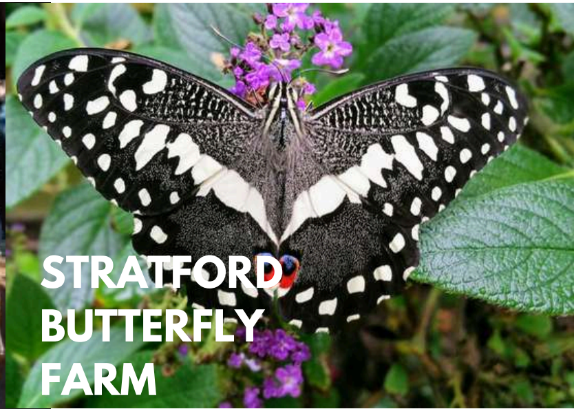
STRATFORD BUTTERFLY FARM