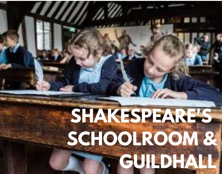
SHAKESPEARE'S SCHOOLROOM & GUILDHALL