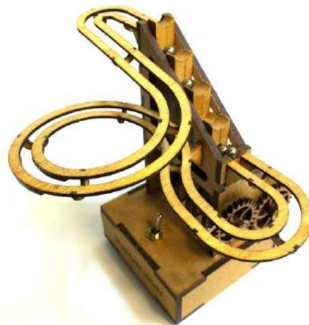
Marble Machine 1 motorised