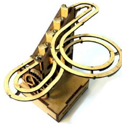
Marble Machine 1 hand-cranked