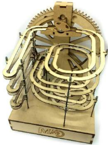
Marble Machine 2