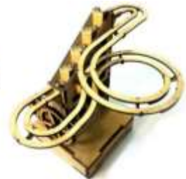
Marble Machine 1 hand-cranked