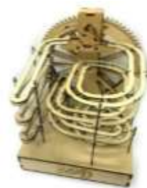
Marble Machine 2