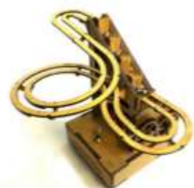
Marble Machine 1 Motorised