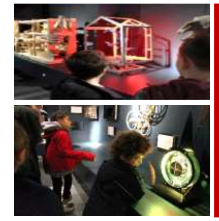
"Once again may I express my sincere thanks to you and the team - excellent as usual!!"

With regards to pre-planned group visits, we can tailor their experience at The MAD Museum to their particular needs. Planning visits, resources and risk assessment documentation is available on request.